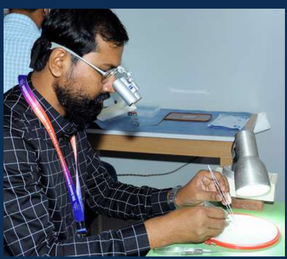
With Loupes (Limited to 20 participants)